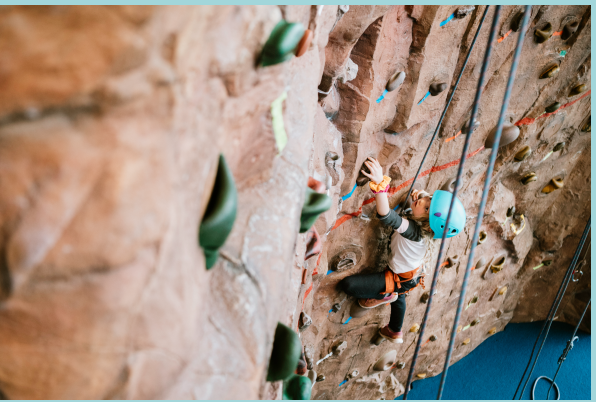
Indoor Rock Climbing